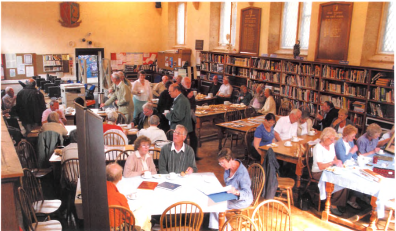
A Thoroton Tea in the Old Hall Library at King's School