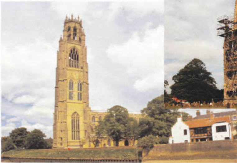
St. Botolph's, Boston (Familiarly known as Boston Stump)