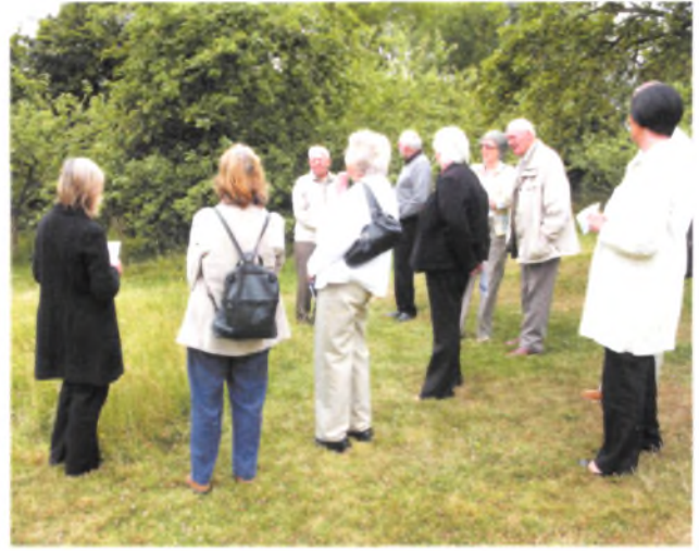
Talk in front of Newton's apple tree, Woolsthorpe