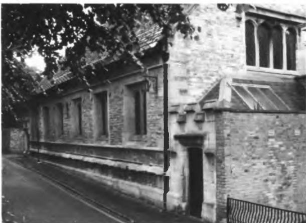
The Old Hall, King's School

The group moved on for lunch to Belton House, a large mansion built for the Brownlow family at the end of the seventeenth century. This gave the opportunity to explore not only the house itself but also the magnificent gardens and extensive park, including the recently restored nineteenth century boathouse at the edge of the lake.