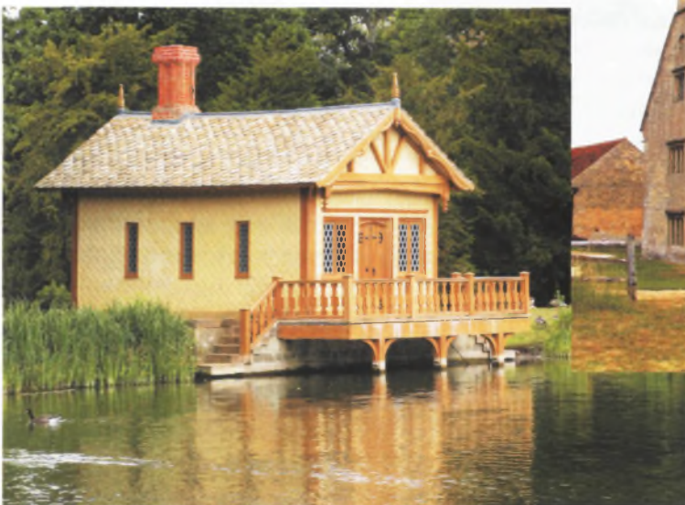
The award winning restoration of the boathouse at Belton House