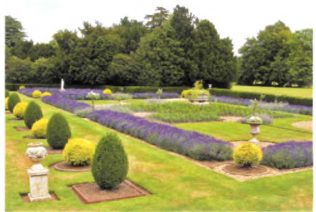
Gardens at Belton House