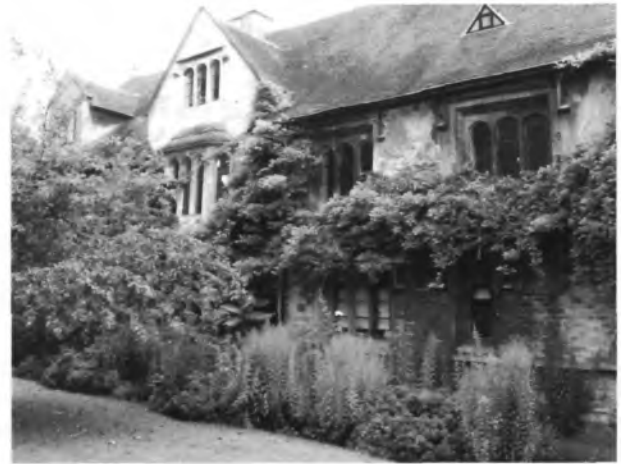
The Master's House

Finally, we visited the old free grammar school in Grantham, together with the nearby schoolmaster's house.