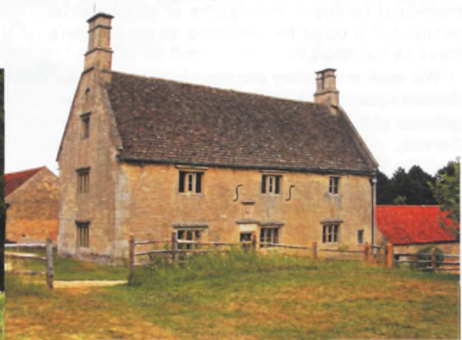
Woolsthorpe Manor House

~ The Thoroton Society of Nottinghamshire ~ ~ The County's Principal Historical Society ~ Visit the Thoroton Website at: www.thorotonsociety.org.uk