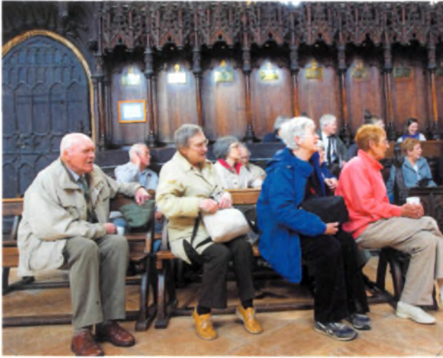
Introductory talk at Boston