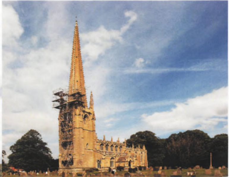
St. Helen's, Brant Broughton