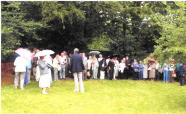
In the rain at King's School, Grantham